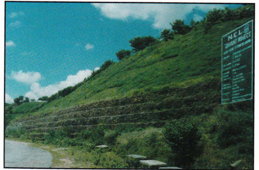
MINESPOIL STABILIZATION ▶