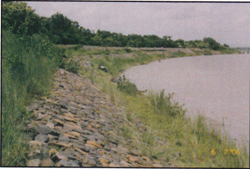
◀ RIVER BANK PROTECTION