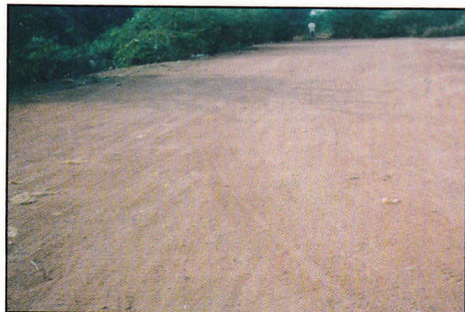
◀ STRENGTHENING OF ROAD EMBANKMENT