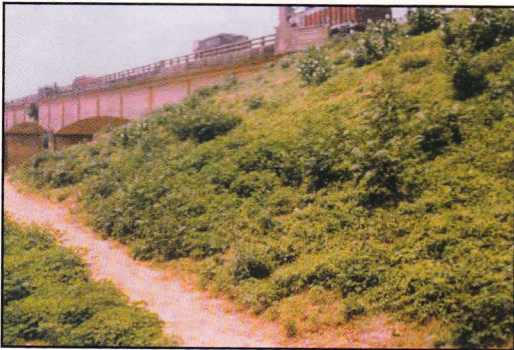
◀ SLOPE STABILISATION