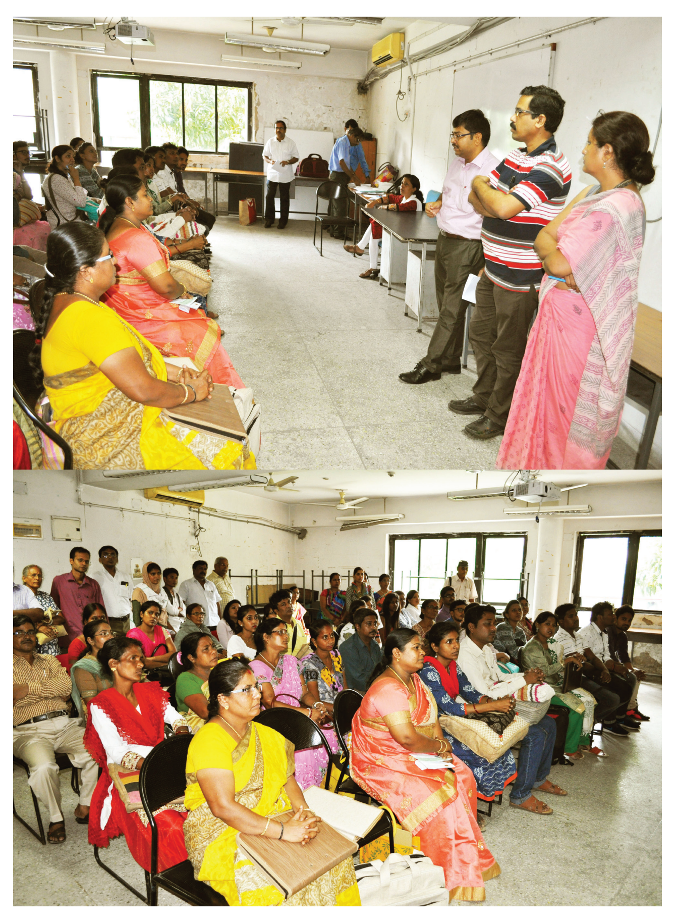
Project Coordinators of NIFT and Officials from NJB addressing the candidates before the Examination