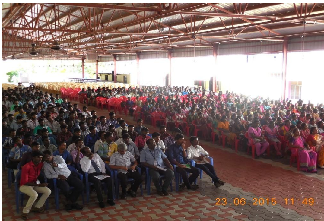
A Section of Students at the Jute SOP Presentation at Madurai