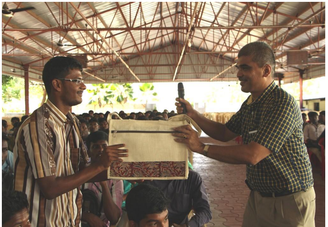
Student being awarded with Jute Prize for answering the Jute related Spot Quiz