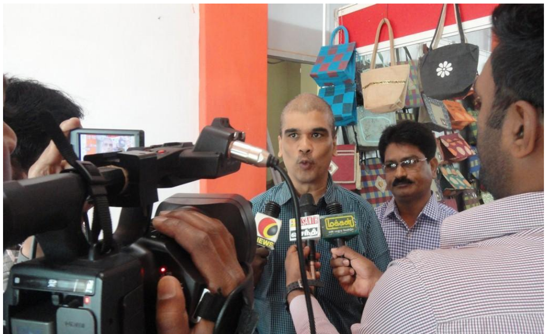
MPO addressing the Press & Media