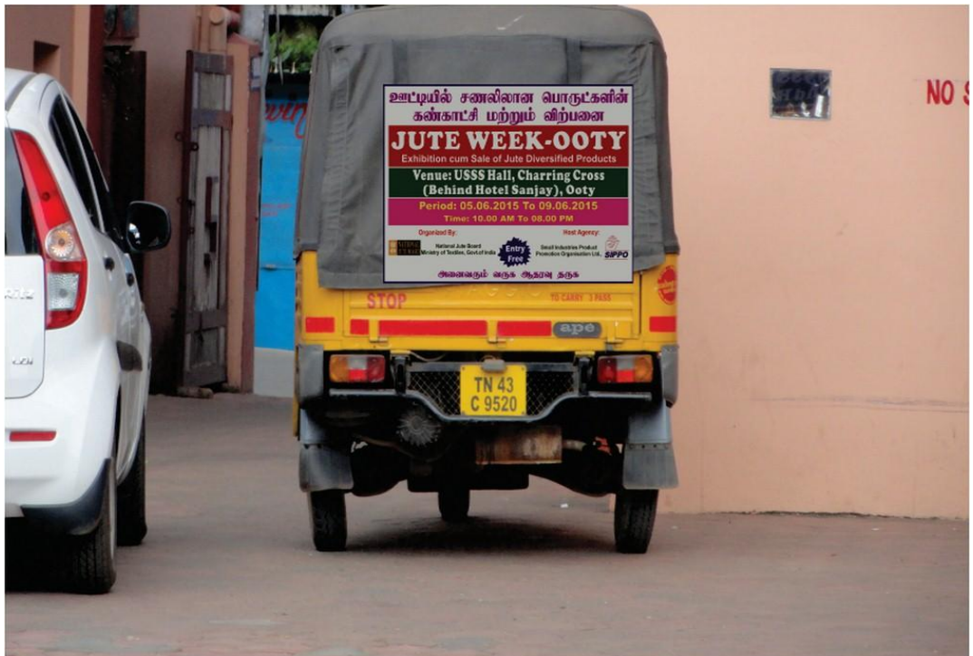
Auto Advertisements were also done during Jute Week