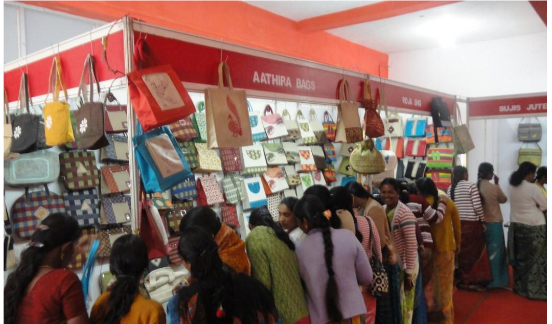
Crowd at Jute stalls