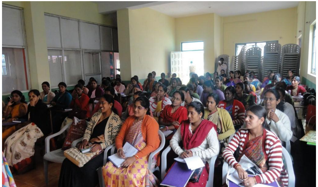
A section of Women SHGs during the Jute Workshop