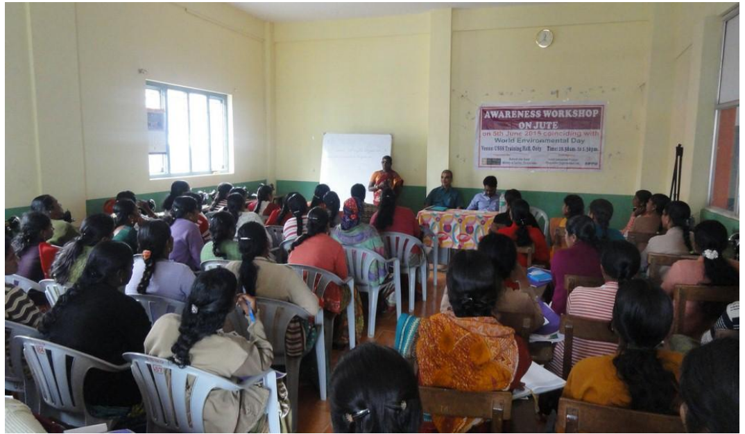
Jute Entrepreneur briefing her Experience at the Jute Workshop