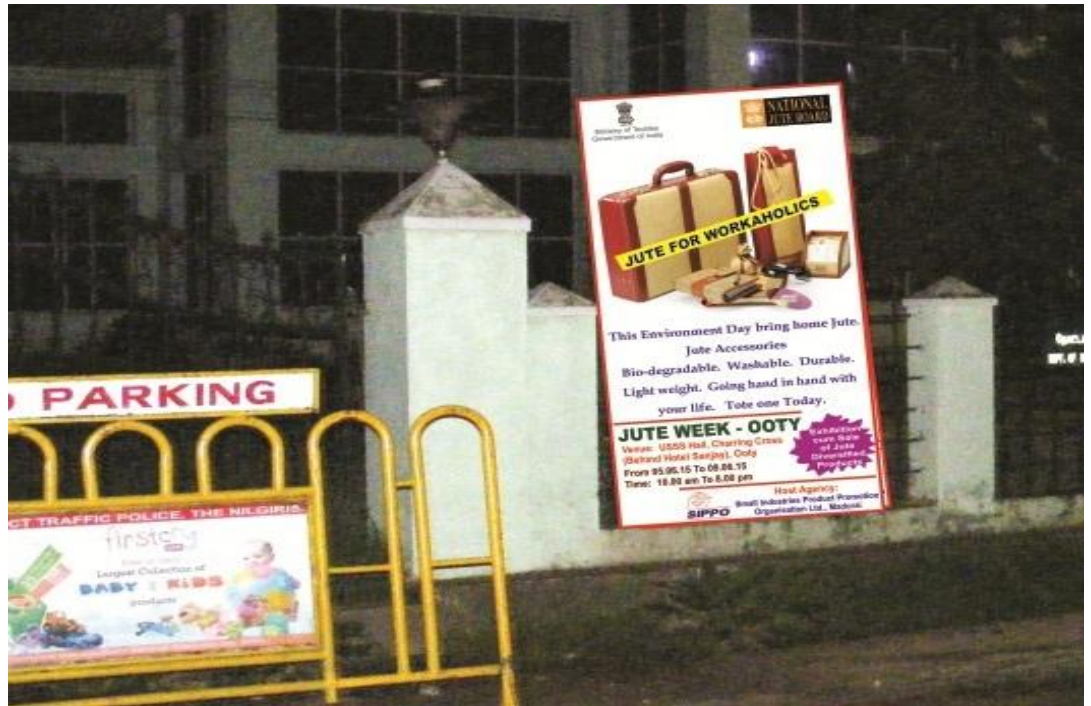
Hoarding were palced at Different places at Ooty