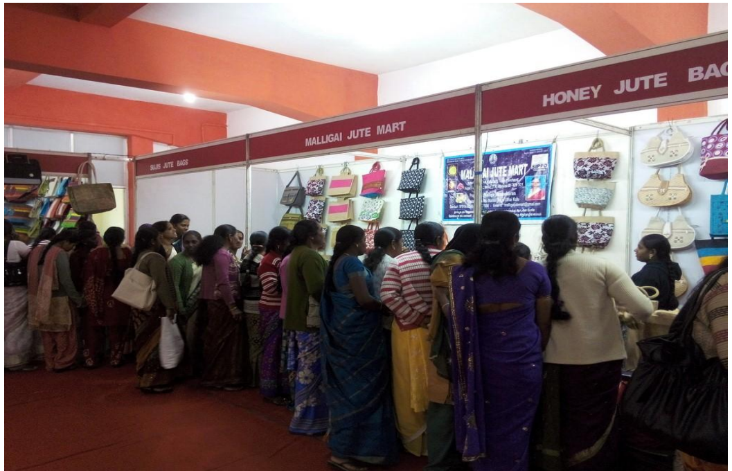
Crowd at Jute Week