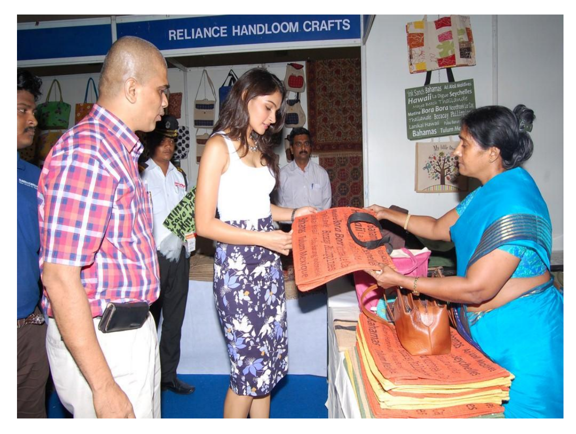
Jute Products being shown to the Chief Guest