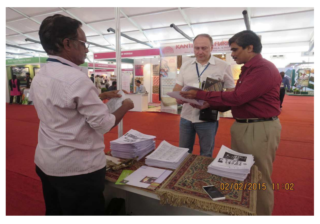
Coir Kerala - Jute Participant's PROFILE being distributed to Foreign Buyers at Stall