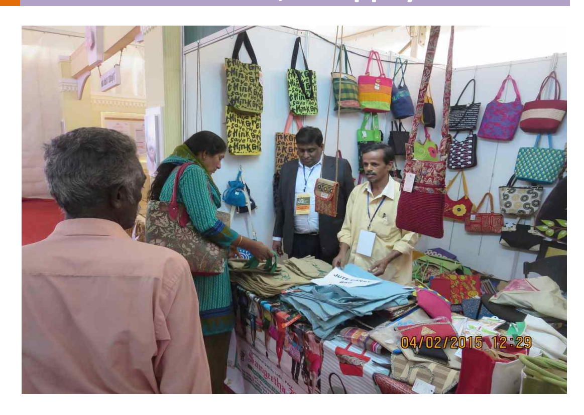
Ekta Intl & BallyFabs selling low Cost Jute bags, at a Specially allotted Booth, as per the directions of NJB, ranging around Rs.10/-