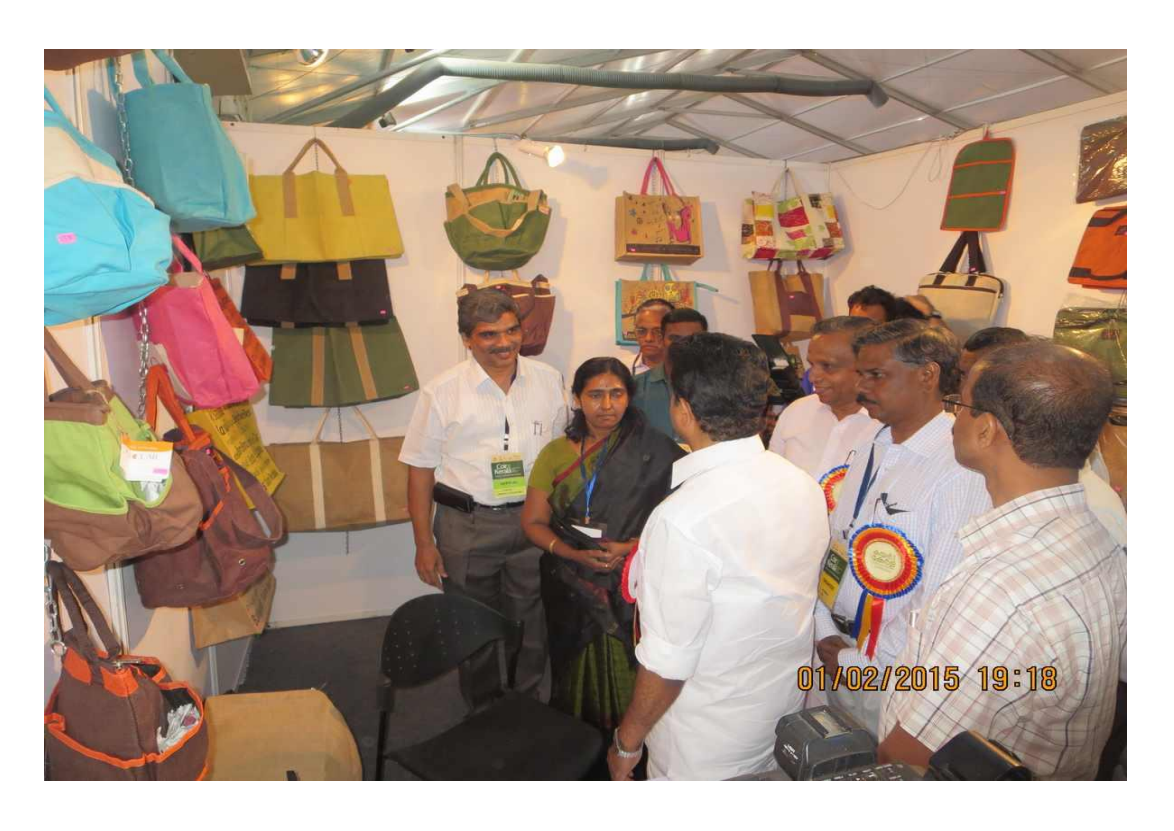
Minister at Leclar Impex Stall