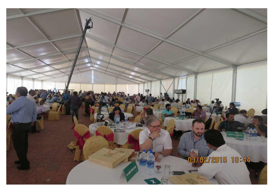
A view of Buyer-Seller Meet at Coir Kerala' 2015