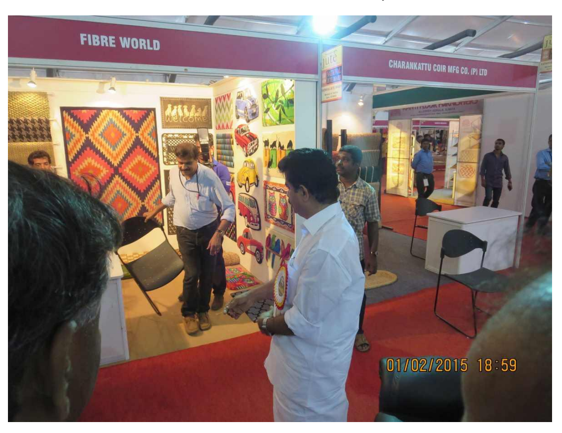
Minister visiting the Fibre World Stall at Jute Stand