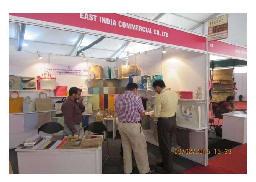
Foreign Buyers being attended at stall of East India Commercial Co. ( Krishna Jute Mills)