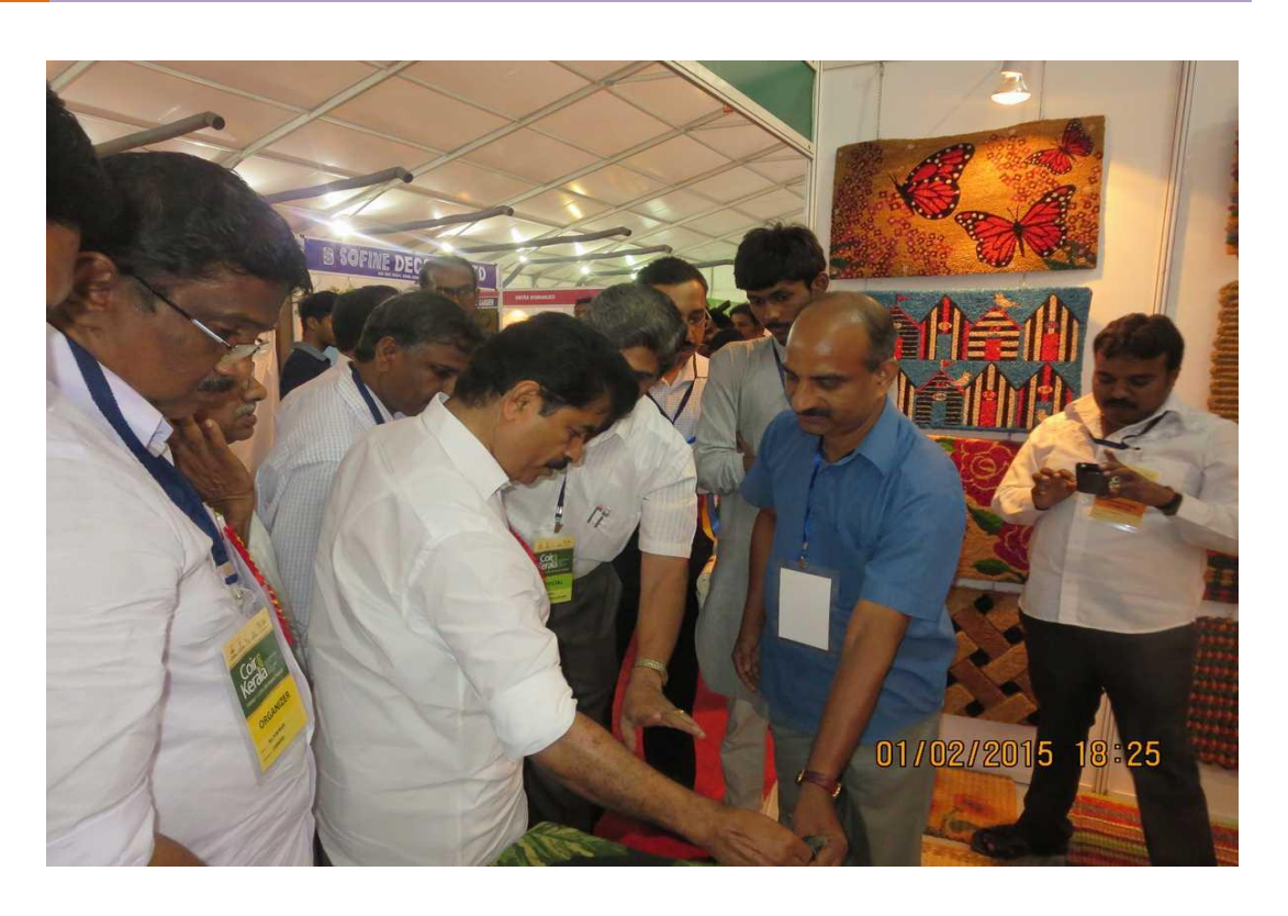
Coir Minister at Eco-Rubber stall in the Jute Stand