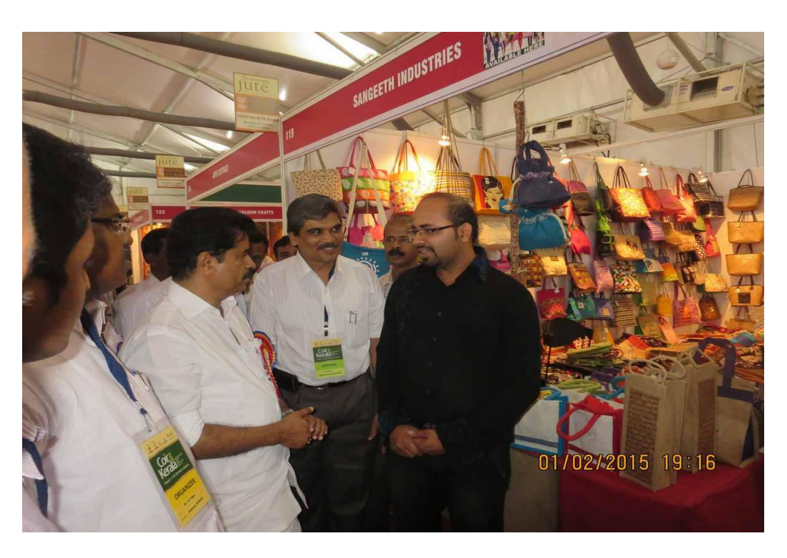
Minister at Kollannur Industries Stall