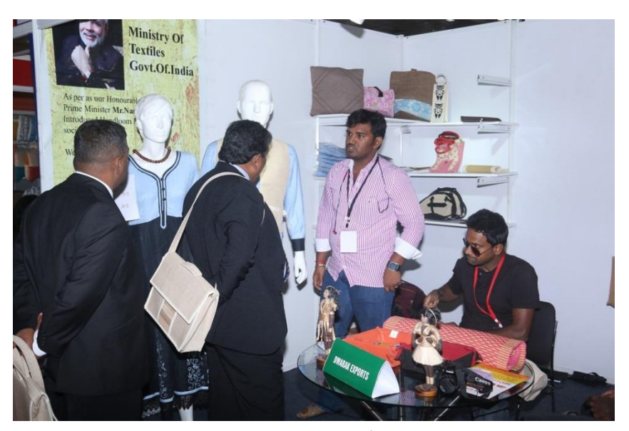
Visitors at IIHF'16