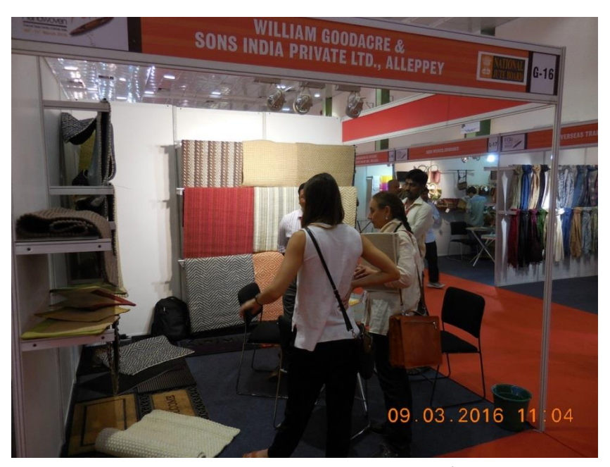
Foreign Buyers at Jute Stall at IIHF'16