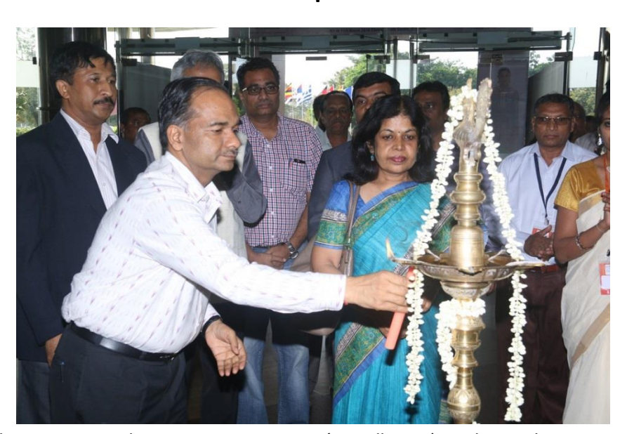
Shri. Alok Kumar, Development Commissioner (Handlooms) Lighting the Lamp at IIHF'16