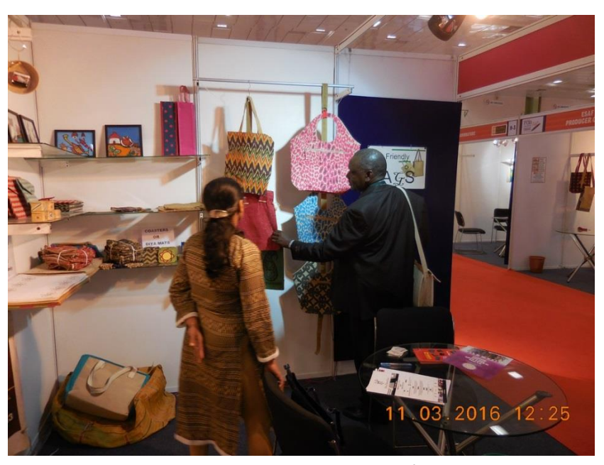
Buyers at Jute Stall at IIHF'16