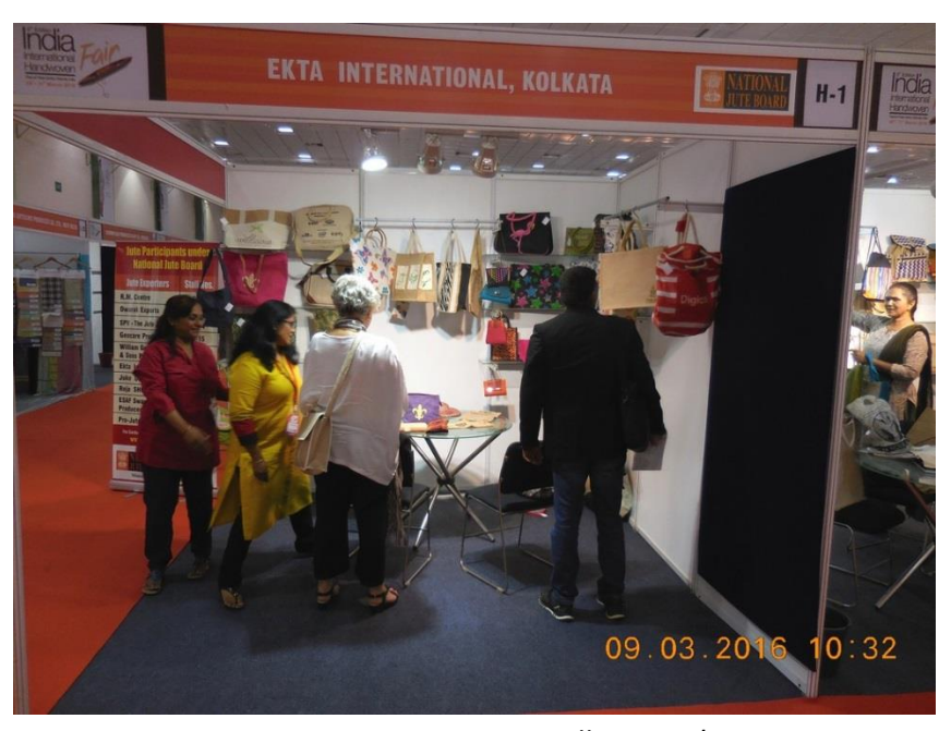
Foreign Buyers at Jute Stall at IIHF'16