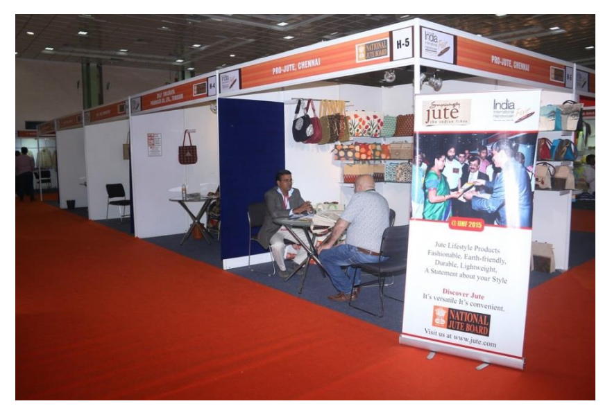
Jute Stalls at IIHF'16