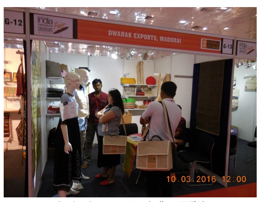
Foreign Buyers at Jute Stall at IIHF'16